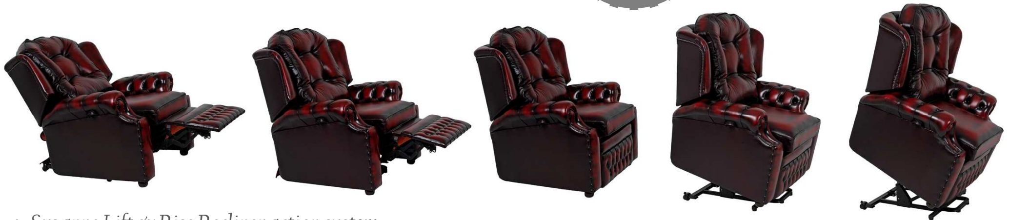
^ Suzanne Lift & Rise Recliner action system

The images below show the stages of our lift & rise recliner chairs & as the mechanism has a dual motor this means you can move the footrest without having to recline back.